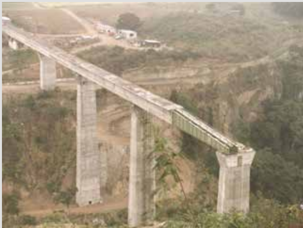
Atoyac Bridge, Mexico