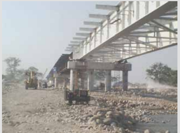
Martínez de la Torre Bridge, Mexico