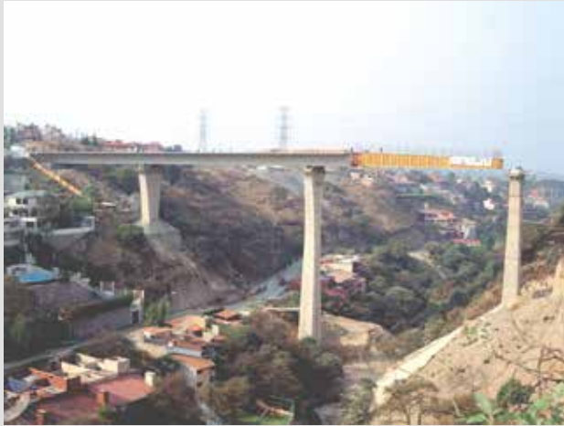
Huixquilucan Bridge, Mexico City