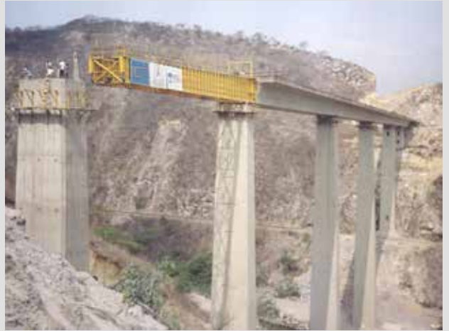
Atenquique I Bridge, Mexico