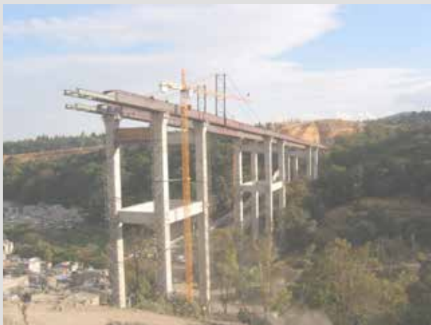
Carlos Pellicer Bridge, Mexico City