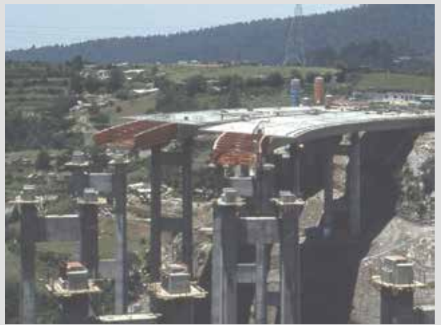
La Marquesa Bridge, Mexico City