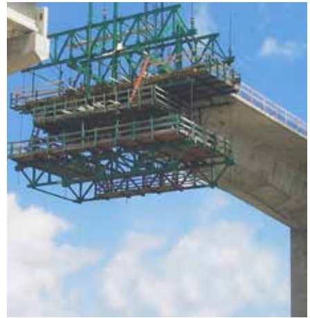
GIWW Bridge, Texas, USA