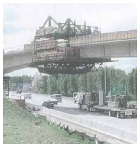
Max Extension / I-205, Oregon, USA