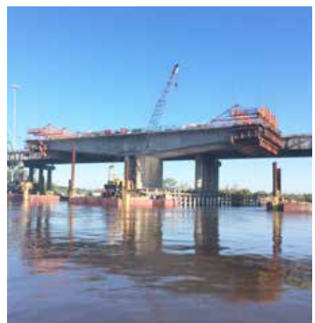
Neches Bridge, Texas, USA