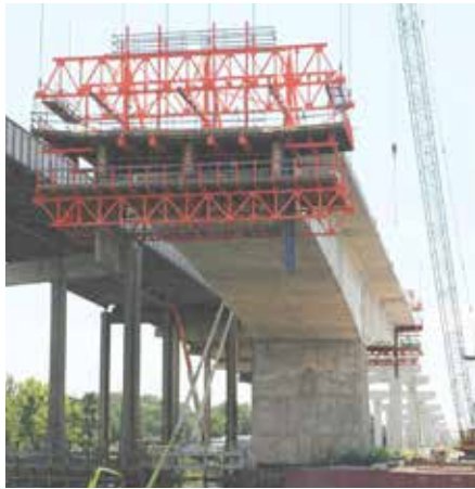
Trinity Bridge, Texas, USA