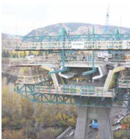
Maroon Creek Bridge, Colorado, USA