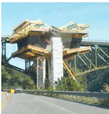
Brattleboro Bridge, Vermont, USA